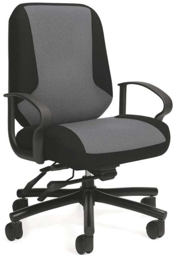
2527 Medium Back Heavy Duty Multi-Tilter

Robust was specifically designed for generously proportioned people who require ergonomically sound seating solutions and rugged durability. Each component was created to provide exceptional strength and tested to exceed normal seating standards so a larger user can be assured of its structural integrity, durability, safety and function.