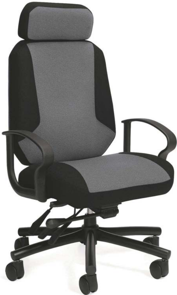
2526 Extended Back Heavy Duty Multi-Tilter with headrest

Robust is the perfect solution for generously proportioned people. It offers an active weight capacity up to 500lbs.